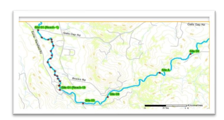
Figure 1. Survey locations